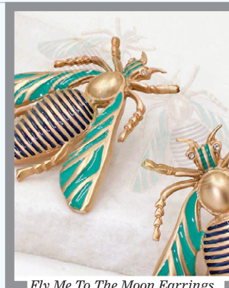
Fly Me To The Moon Earrings